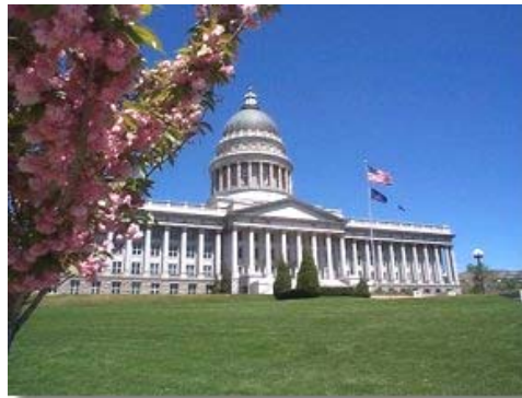
Utah State Capitol Building

We welcome your feedback on this special issue.