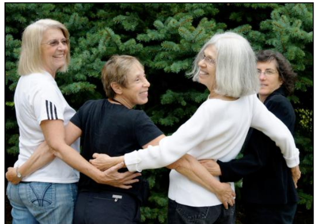
We've Got Your Back!